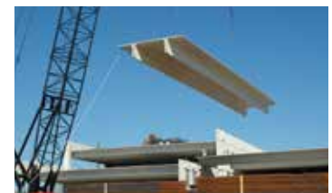
Prefabricated / Modular