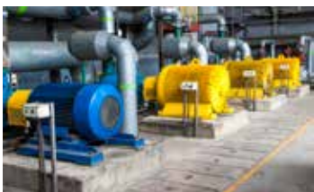
Plant / Equipment Installation