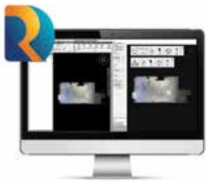
ClearEdge3D Rithm for Navisworks®