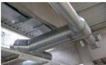
Mechanical / Plumbing