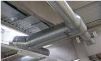
Mechanical / Plumbing