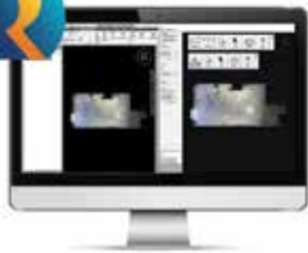
ClearEdge3D Rithm for Navisworks®