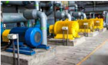
Plant / Equipment Installation