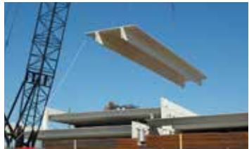
Prefabricated / Modular