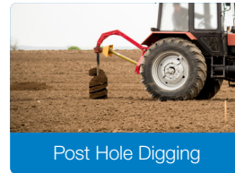
Post Hole Digging