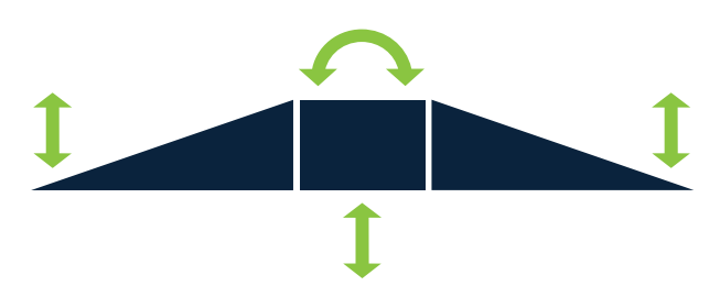
Active Roll <sup>™</sup>

Basic, low-cost height control solution for smaller booms (up to 30 m). Ideal for mild, flatter terrain.